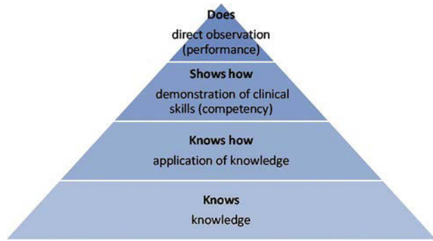
Figure 1 Miller's pyramid for assessment of clinical competence.