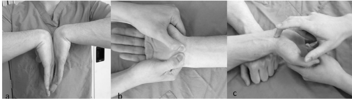
Figure 1. Provocative testing in Carpal Tunnel Syndrome (a) Phalen's test, wrist hyperflexion; (b) Durkan's test, direct compression of the median nerve; (c) Tinel's sign, tapping over the course of the nerve elicits paresthesias

and decompress the nerve in the carpal tunnel. Endoscopic techniques have a faster recovery time and higher patient satisfaction within the first several weeks when compared to traditional open approaches, but these differences are undetectable at one year of follow-up. 8